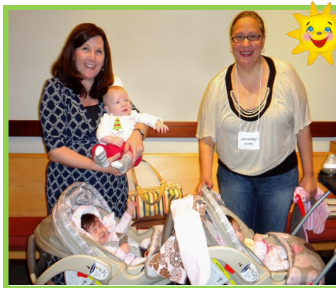
Future Preschool Attendees with Their Moms!

The St. Mark's Preschool Board is working with The Southwestern Association of Episcopal Schools (SAES) to ensure that our preschool will become accredited in the future. SAES sets a high standard for Episcopal accrediting in the United States and has a mission "to lead, to nurture and to unify Episcopal schools in order to advance educational excellence with the faith community of the Episcopal Church."